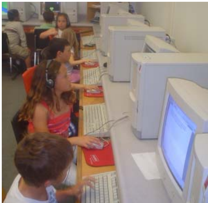
Students at Southside School practice their lessons in the computer lab, striving to meet the requirements for high school technology classes.

The long term goals for the Southside School Endowment Fund and its active Parents Club are to augment the programs that would have been lost because of state cutbacks in funding as well as develop new programs that will allow the school to continue to meet its high standards of excellence. 🦋