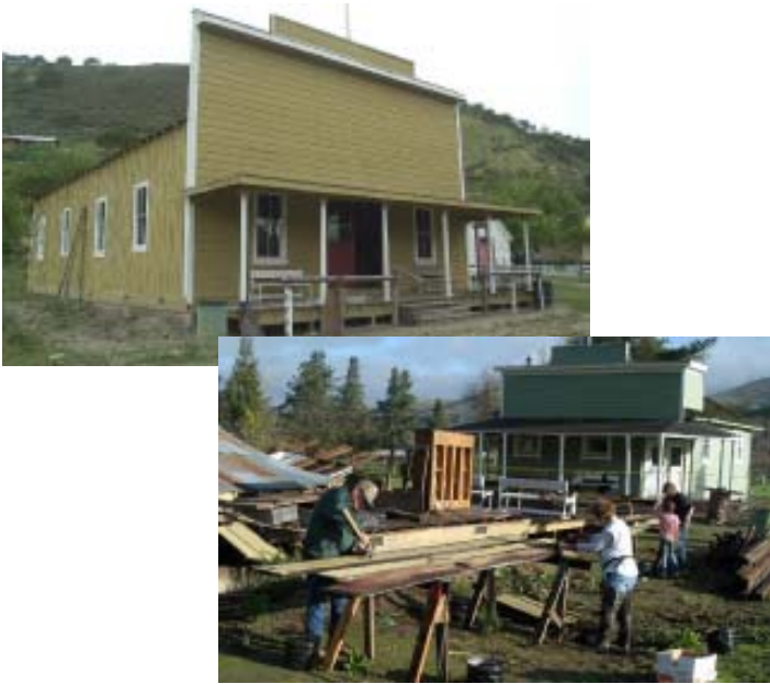
The 1890 Dunneville Dance Hall is shown restored at the Historical Park in the top photo and then with members picking up the pieces after a storm blew the building down on January 1, 2006.