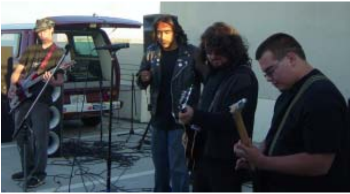
Dark Horse Battalion were pumped to play on top of the Parking Garage; they had just won second place at the Gilroy Garlic Festival Battle of the Bands.