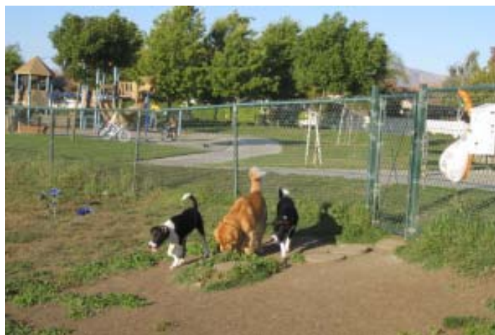
A poorly maintained section of Frank Klauer Park (creek overflow) is currently the only area dog owners in Hollister are allowed to let their dogs run off-leash.

This newsletter features three new organizations in our community, and a fourth organization that has managed to grow their services even in these economically difficult times. The Community Foundation hopes you will support these groups with your time and your donations.