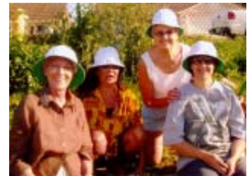
A few of the members of HDOG "paws" for a photo while walking their dogs in the temporary park.

In addition to being the catalyst for Hollister's first dog park, HDOG is working towards the establishment of a cohesive dog owners group, consisting of people who are willing to spend time and donate money towards the establishment of the park. This group will be responsible for educational efforts towards dog owners using the area, and will help with operations and maintenance once the park is established. The group will maintain ongoing com-