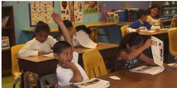
Children receive help in the homework club including enrichment on a variety of subjects.

Hollister Youth Alliance 310 Fourth Street 831.636.2853 hollisteryouthalliance.org