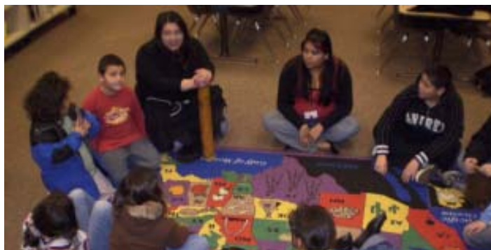
Students and leaders in the Gavilan College Art 4 Change Program create a mural for the entrance of the Calavaras School Library.