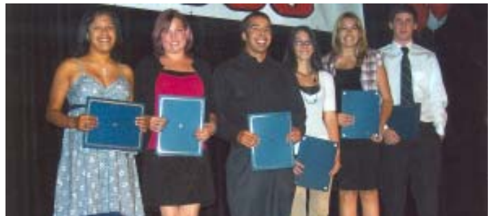
The most recent recipients of the Hope for a Cure Memorial Educational Scholarship Grant Program pause for a photo.

Hope for a Cure Memorial Educational Scholarship Grant Program 831.630.1924