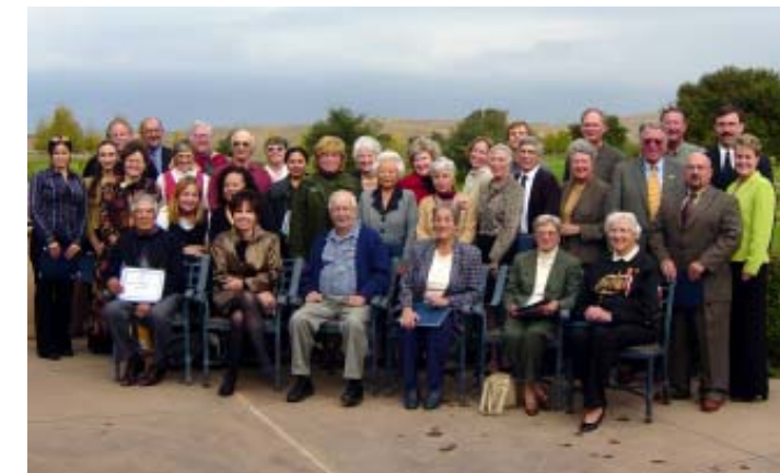
National Philanthropy Day recipients gathered for a quick photo after a wonderful celebration of their volunteerism, truly the heart of San Benito County.